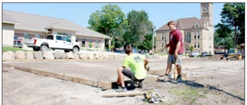
Work has begun on a new residential duplex being built on the former First Baptist Church property in downtown Grundy Center.

hope this can help fill the need for housing in town, especially housing close to downtown."