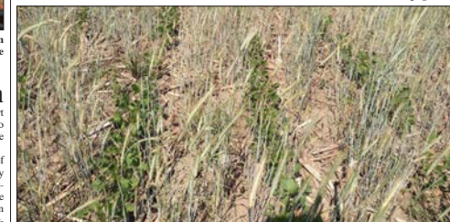
A cover crop field planted with rye and soybeans on Fred Abels's farm near Holland. Abels will be one of the hosts of an upcoming soil health and water quality workshop at the Grundy County Fair next Wednesday.

Resources Conservation Service (NRCS) office launched a collaborative effort to address water quality in the area, it's been a gradual march toward progress. And now that more farmers are coming onboard, they're hoping to engage city dwellers on practices that can reduce runoff and pollution as well. Next Wednesday morning during the Grundy County Fair, the groups will host a soil health and water quality workshop from 9:00 a.m. to 1:30 p.m. featuring five guest speakers and focusing on all aspects of the issue, from farming techniques to urban conservation. See WORKSHOP page 3